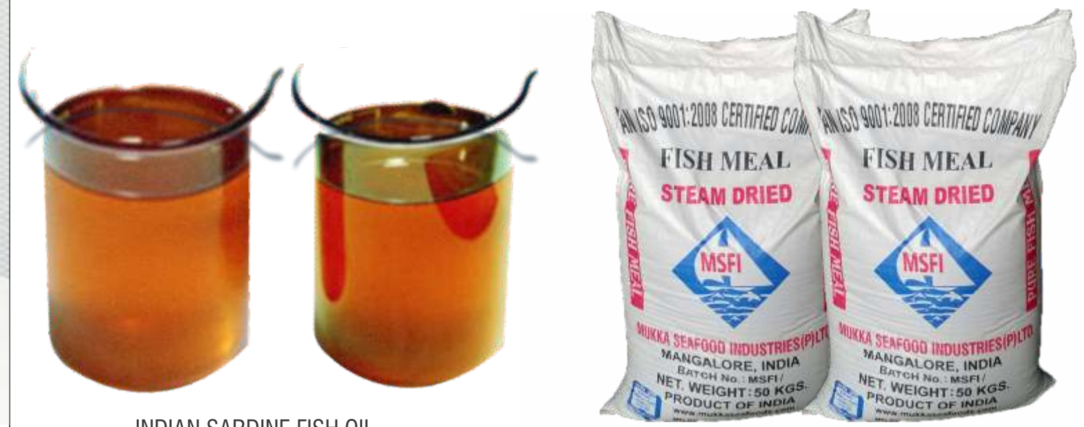
INDIAN SARDINE FISH OIL

OUR PRODUCT RANGE : FISH MEAL, FISH OIL, FISH SOLUBLE PASTE